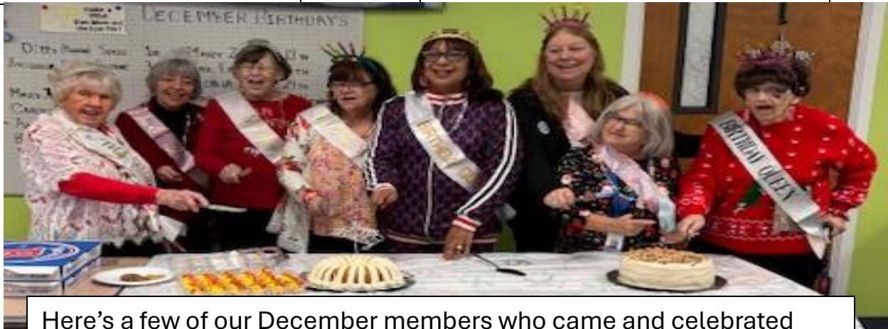
Here's a few of our December members who came and celebrated their birthdays. Come join us for yours so we can celebrate with you!